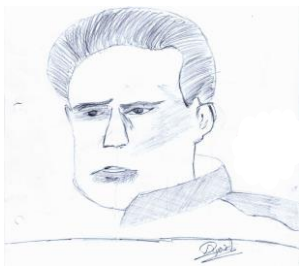
Sketched by Suyash of Class VI