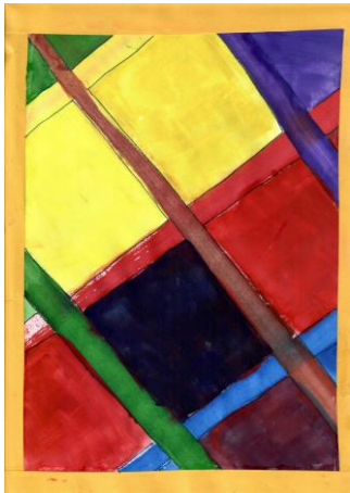
The Perspective Painted by Suyash of Class VI